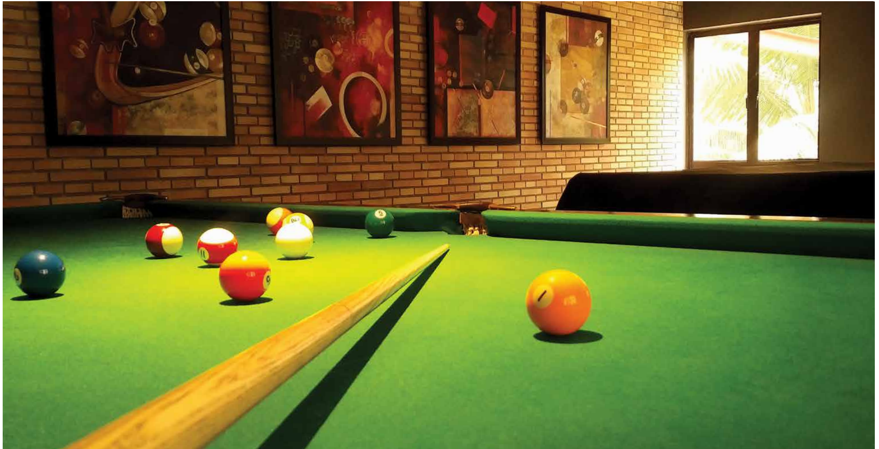
Indoor Games Room