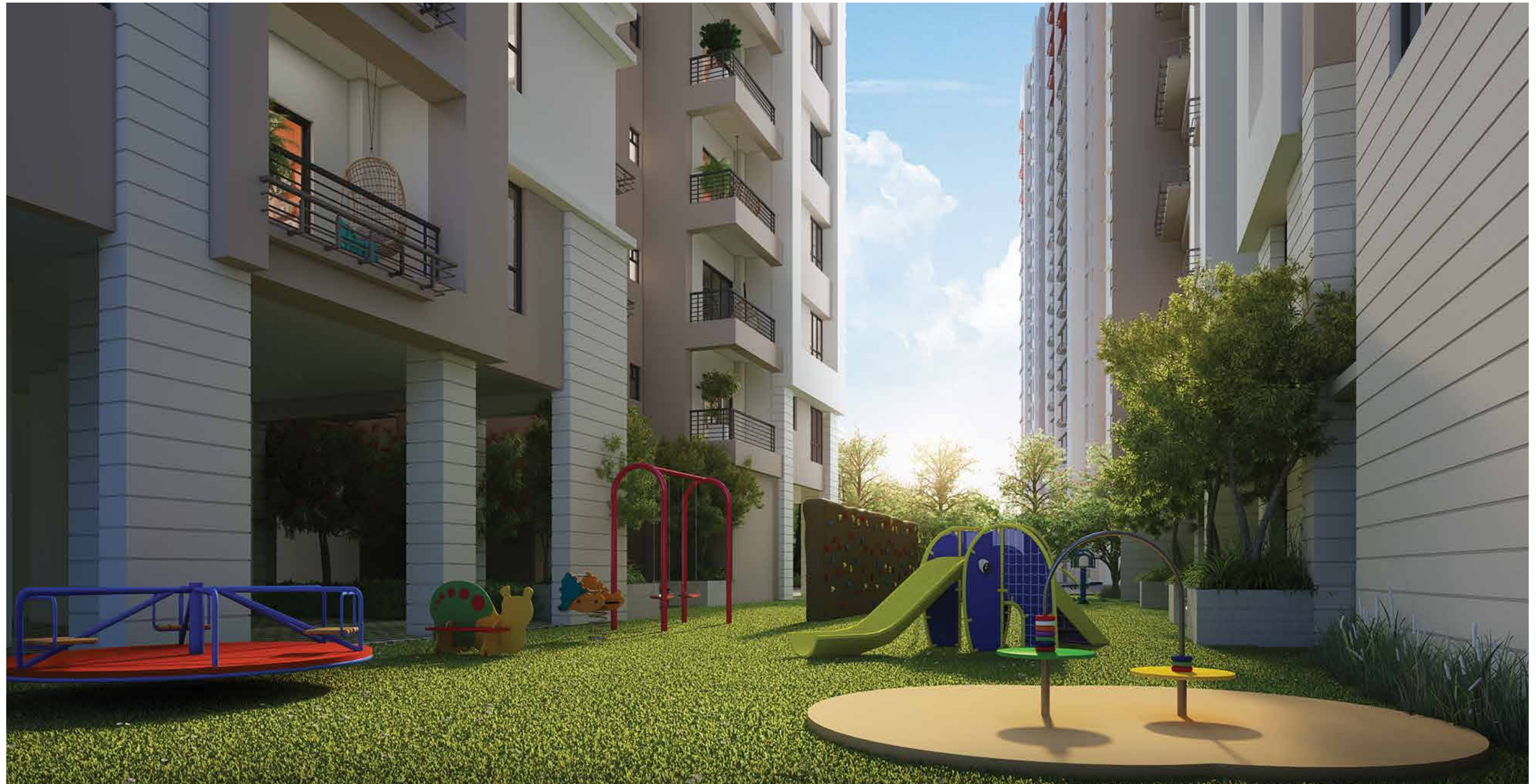
Kids' Play Area