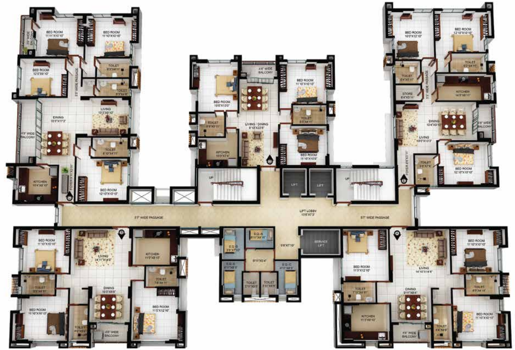
Tower-1 | 3rd floor plan (Area as per WBHIRA)