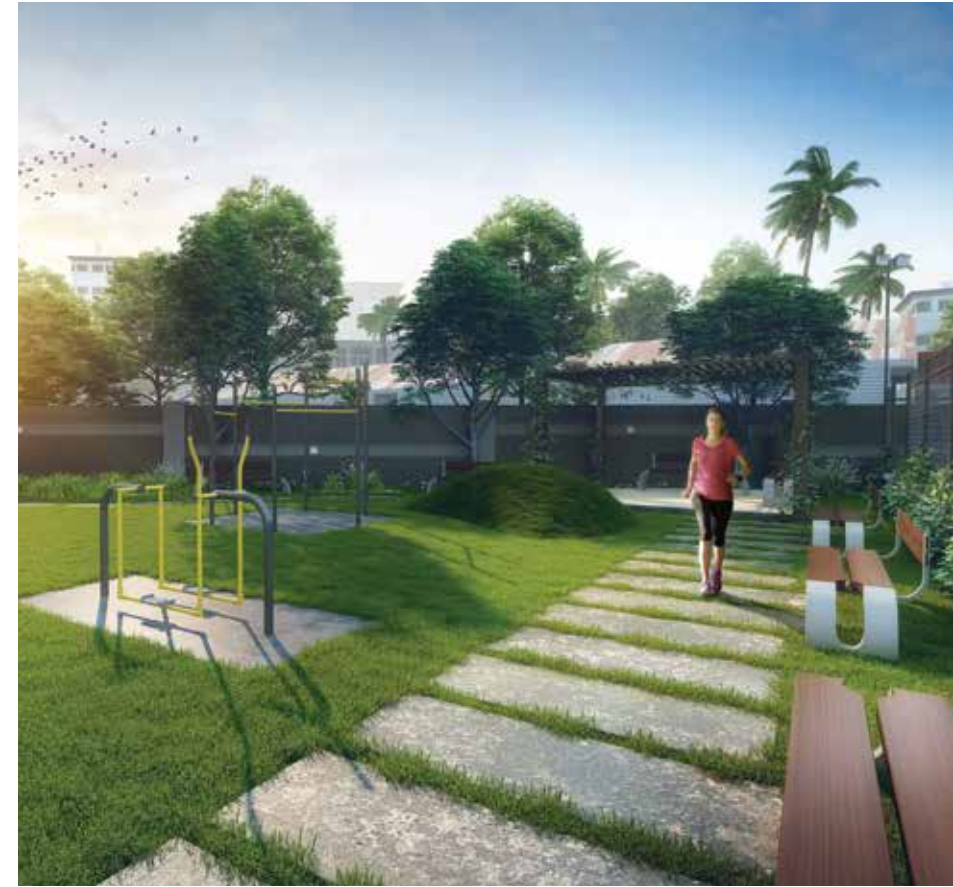
Outdoor fitness zone