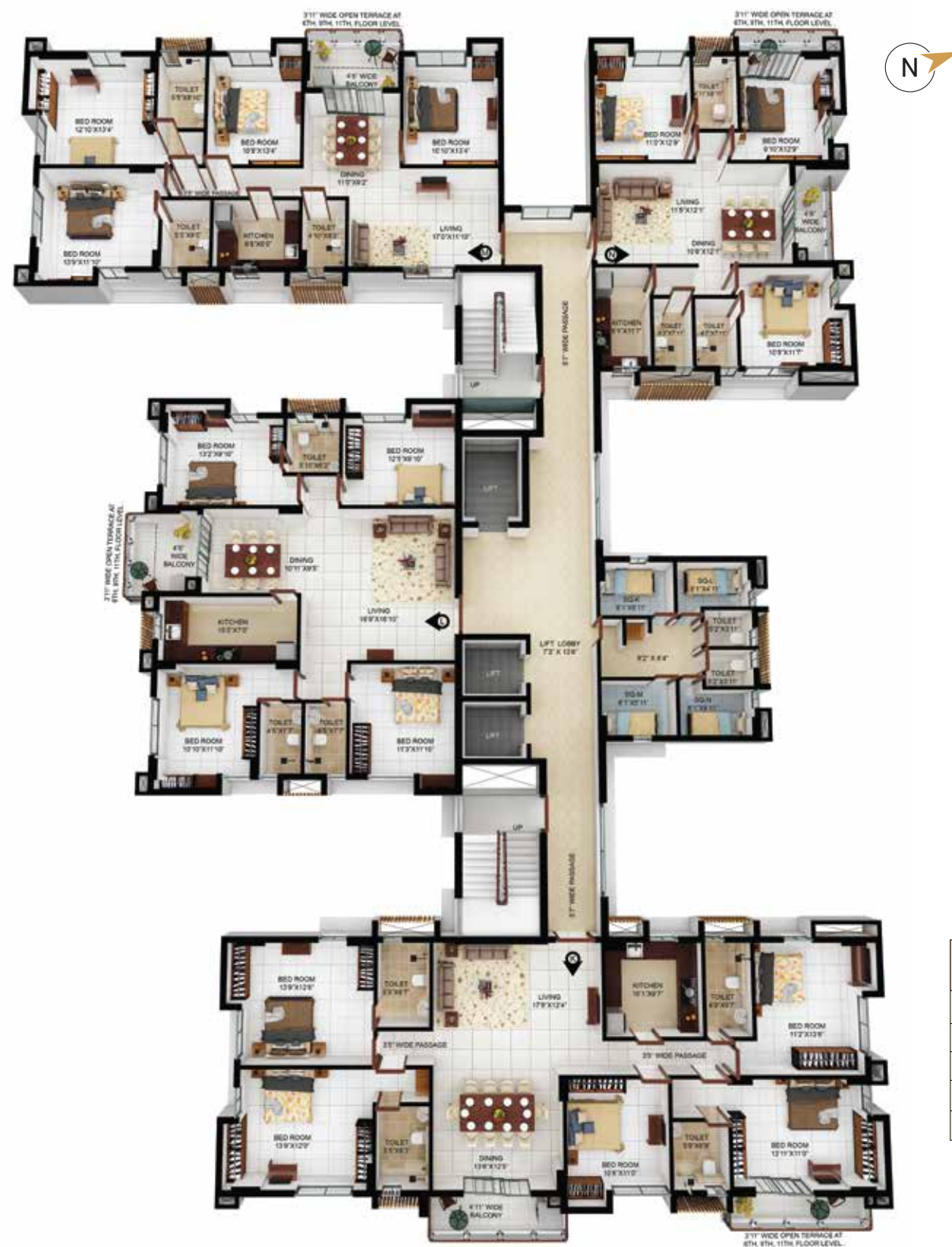
Tower-3 | 6th, 9th & 12th floor plan (Area as per WBHIRA)