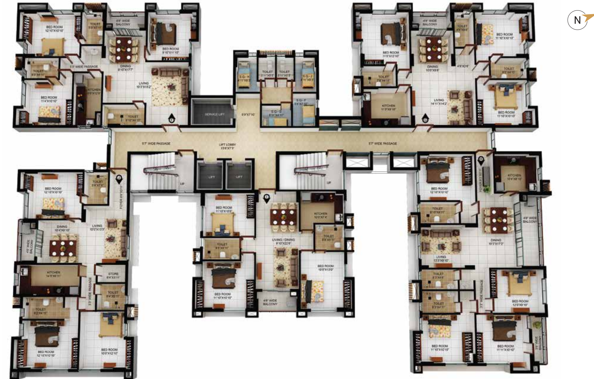
Tower-2 | 2nd & 3rd Typical floor plan (Area as per WBHIRA)

The dimension shown in the floor plans are shown as estimated. In certain areas the width or length can be reduced, due to service ducts or any other installation as may be required and suggested by architect