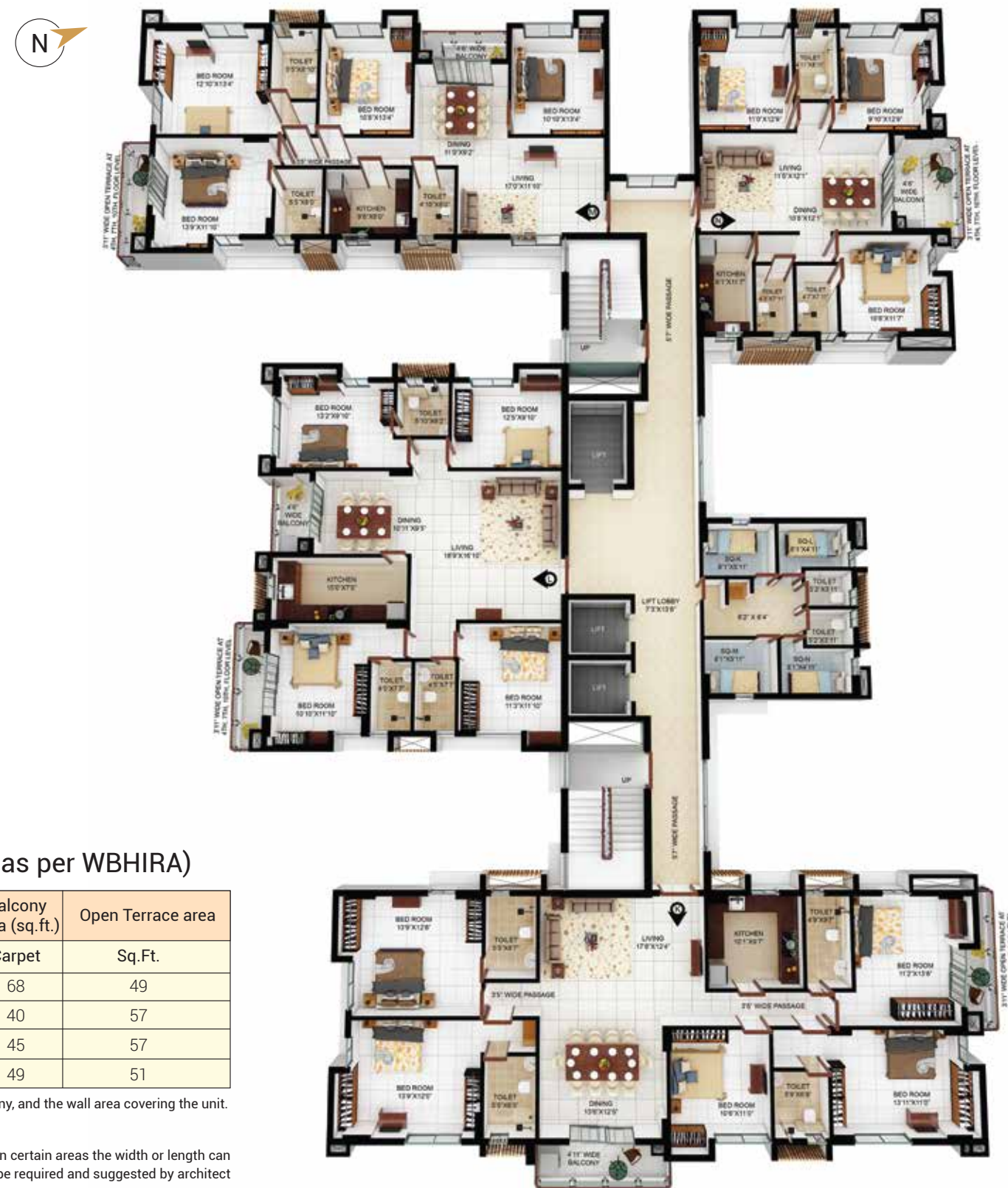
Tower-3 | 4th, 7th & 10th floor plan (Area as per WBHIRA)