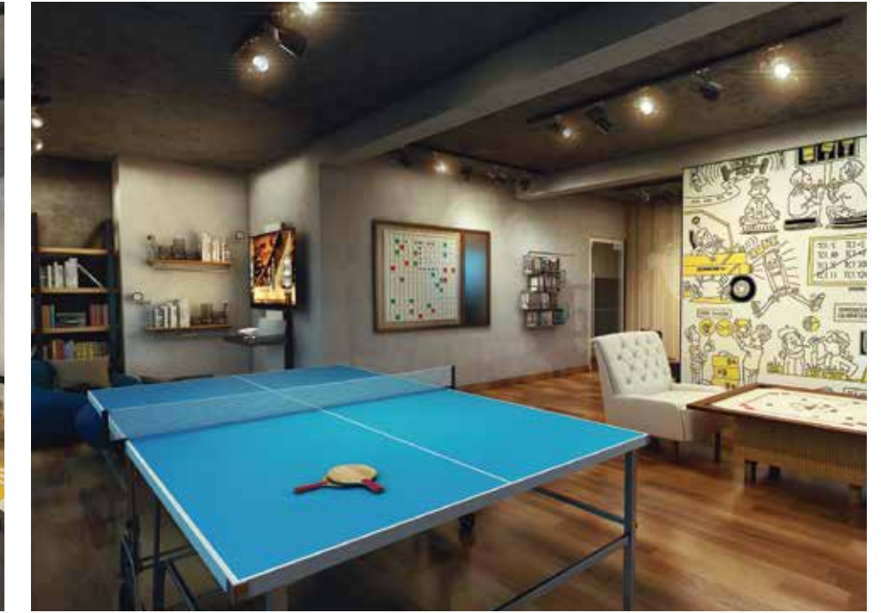
AC indoor games room