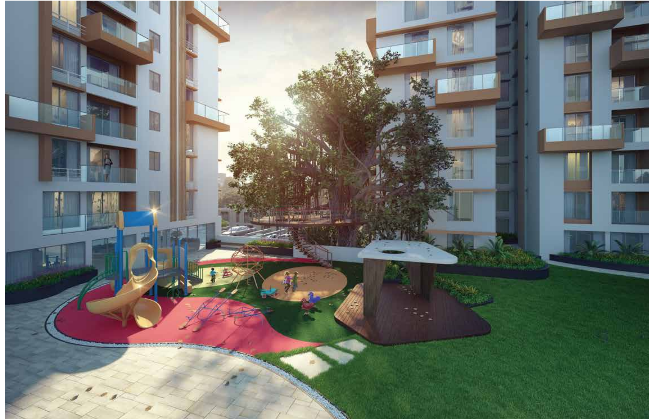
Central landscaped zone with Kid's play area