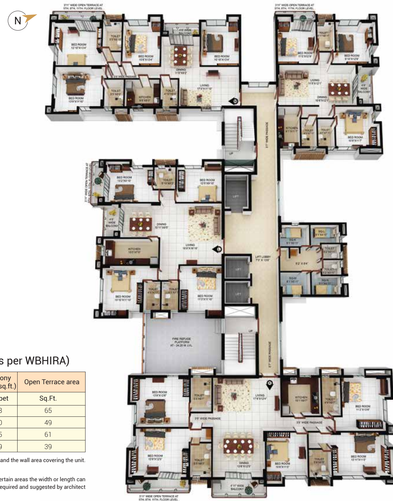
Tower-3 | 5th, 8th & 11th floor plan (Area as per WBHIRA)

The dimension shown in the floor plans are shown as estimated. In certain areas the width or length can be reduced, due to service ducts or any other installation as may be required and suggested by architect