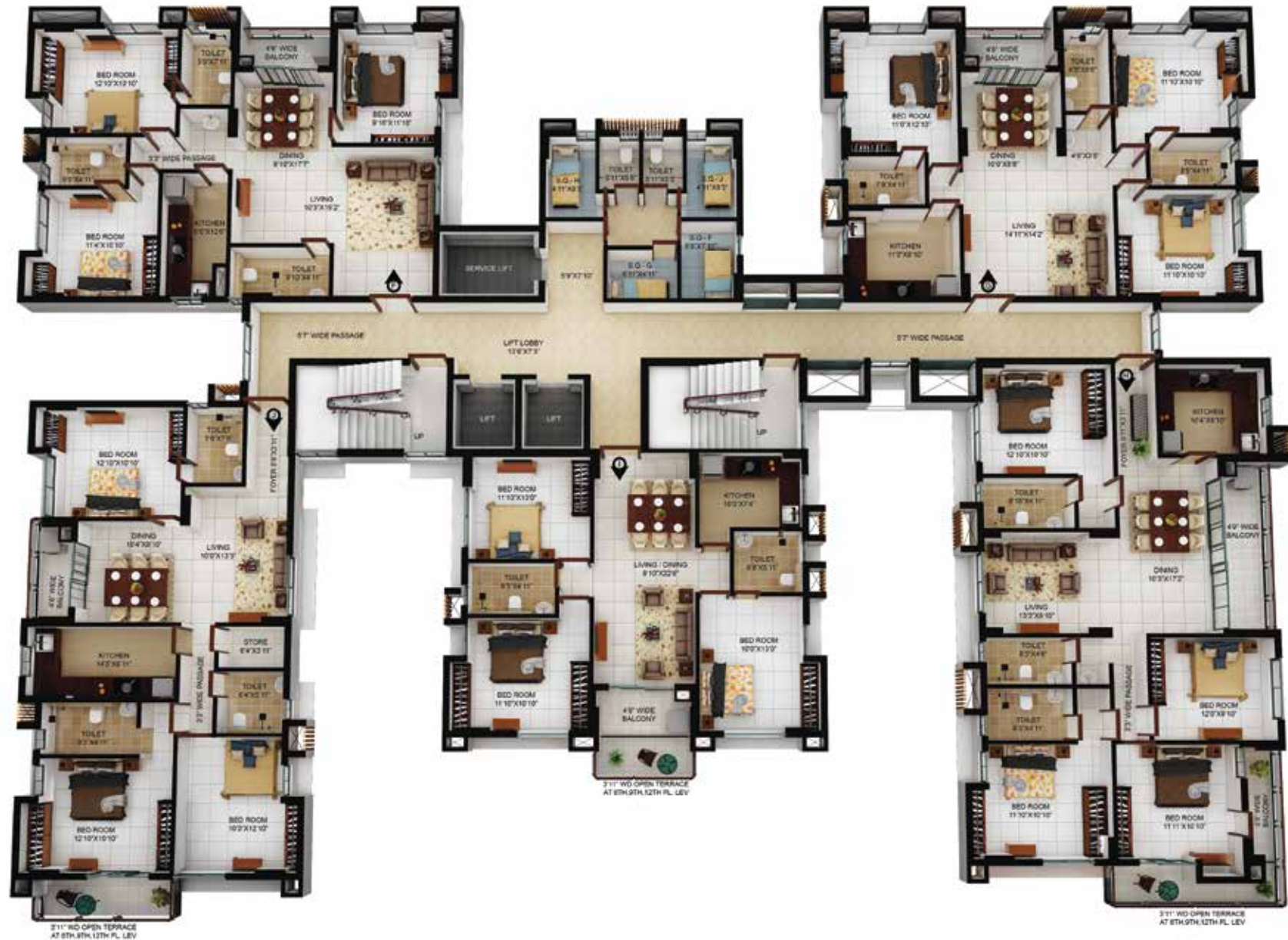
Tower-2 | Typical floor plan | 6th, 9th & 12th floor (Area as per WBHIRA)