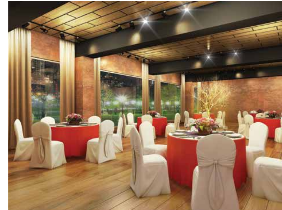
AC community hall