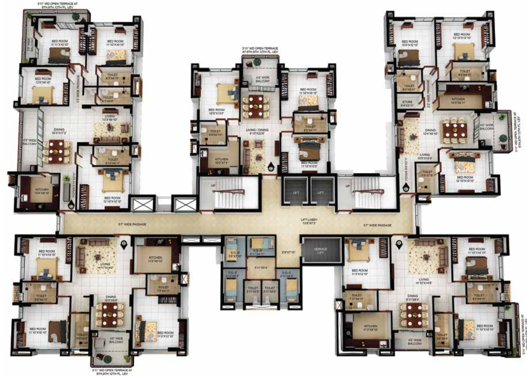
Tower-1 | Typical floor plan | 6th, 9th & 12th floor (Area as per WBHIRA)