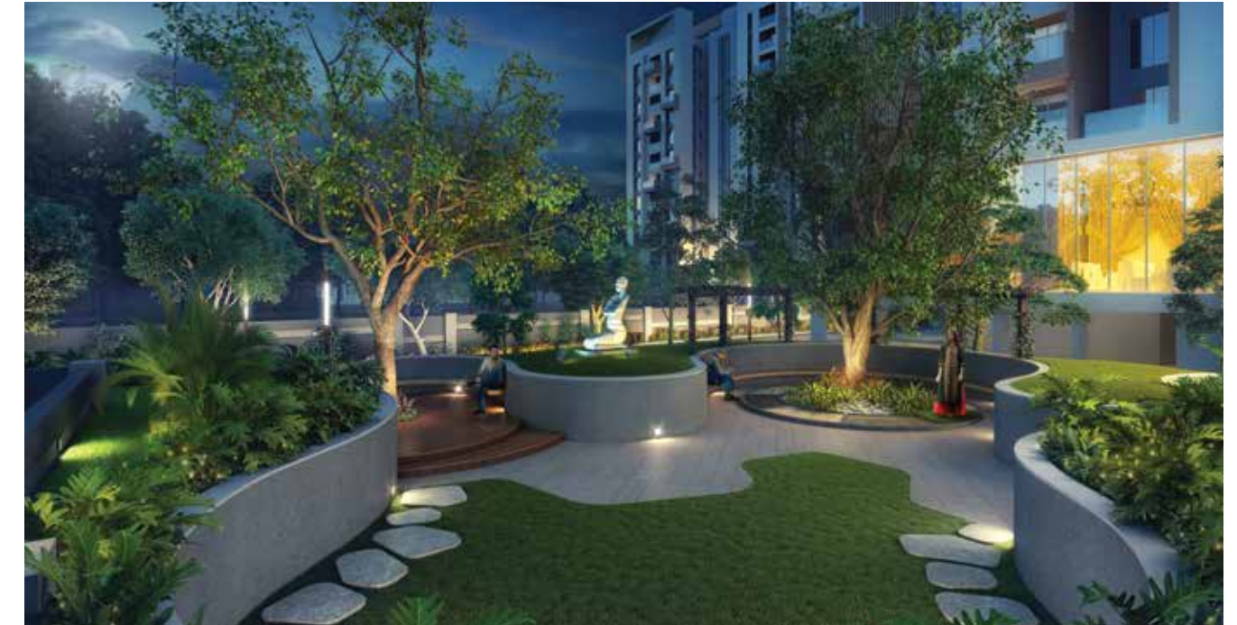
Therapy gardens with multi-experience sensory walk