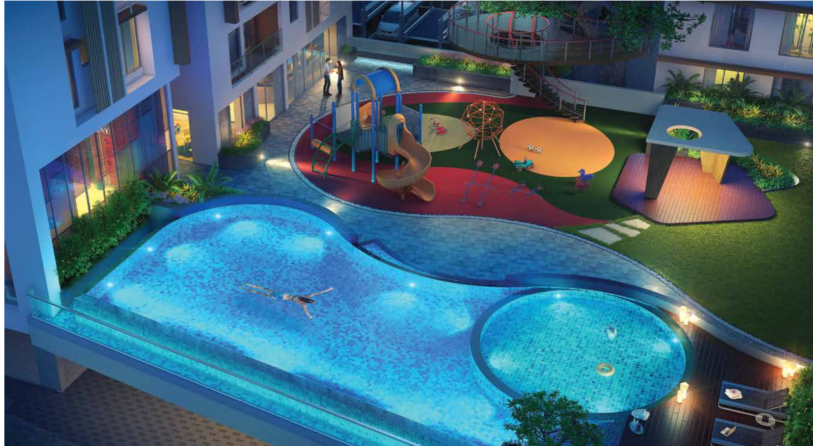
Infinity swimming pool