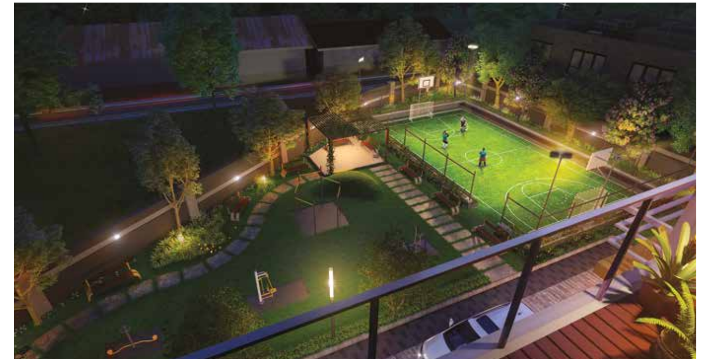
Multi-purpose sports arena