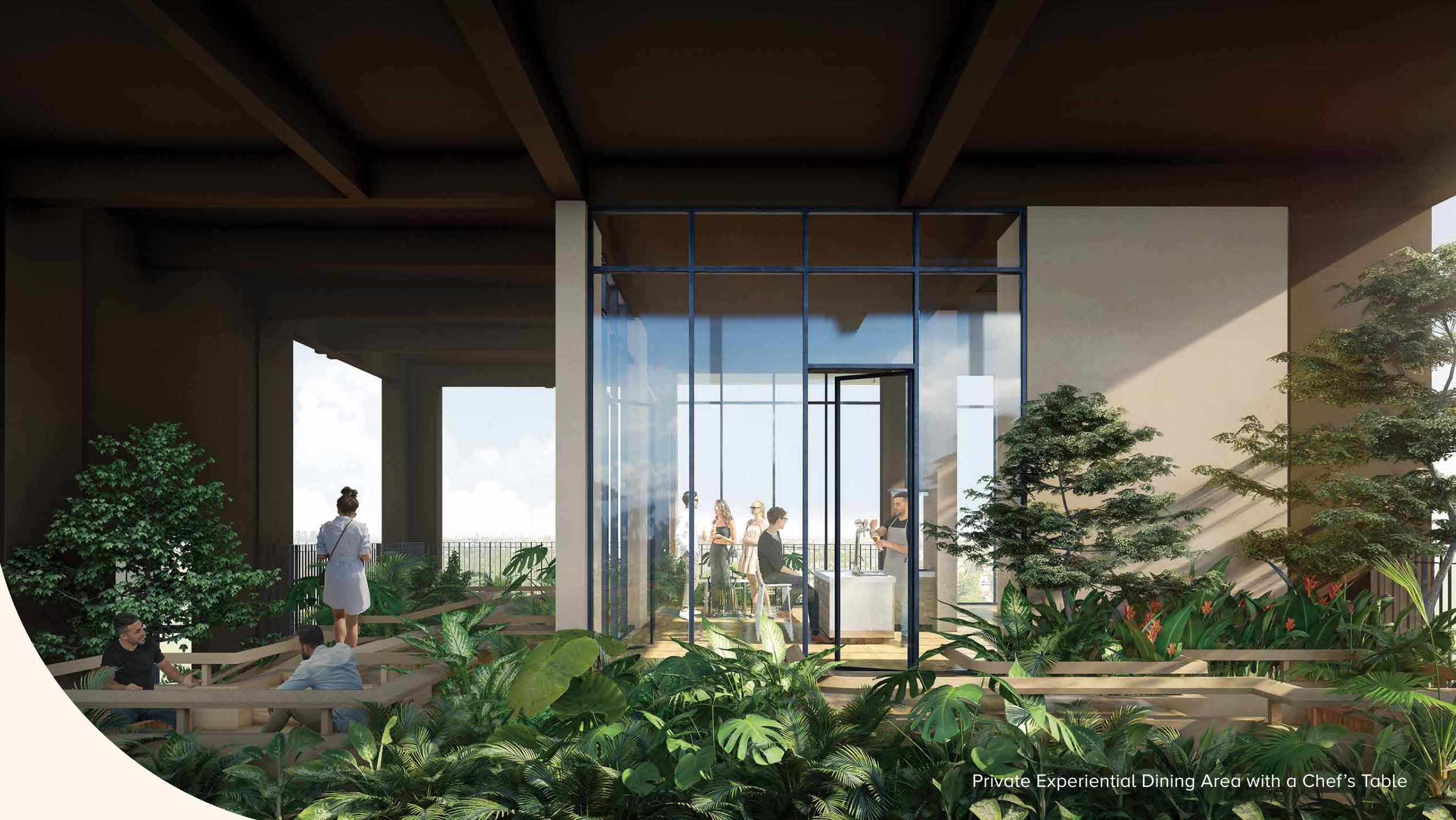
Private Experiential Dining Area with a Chef's Table