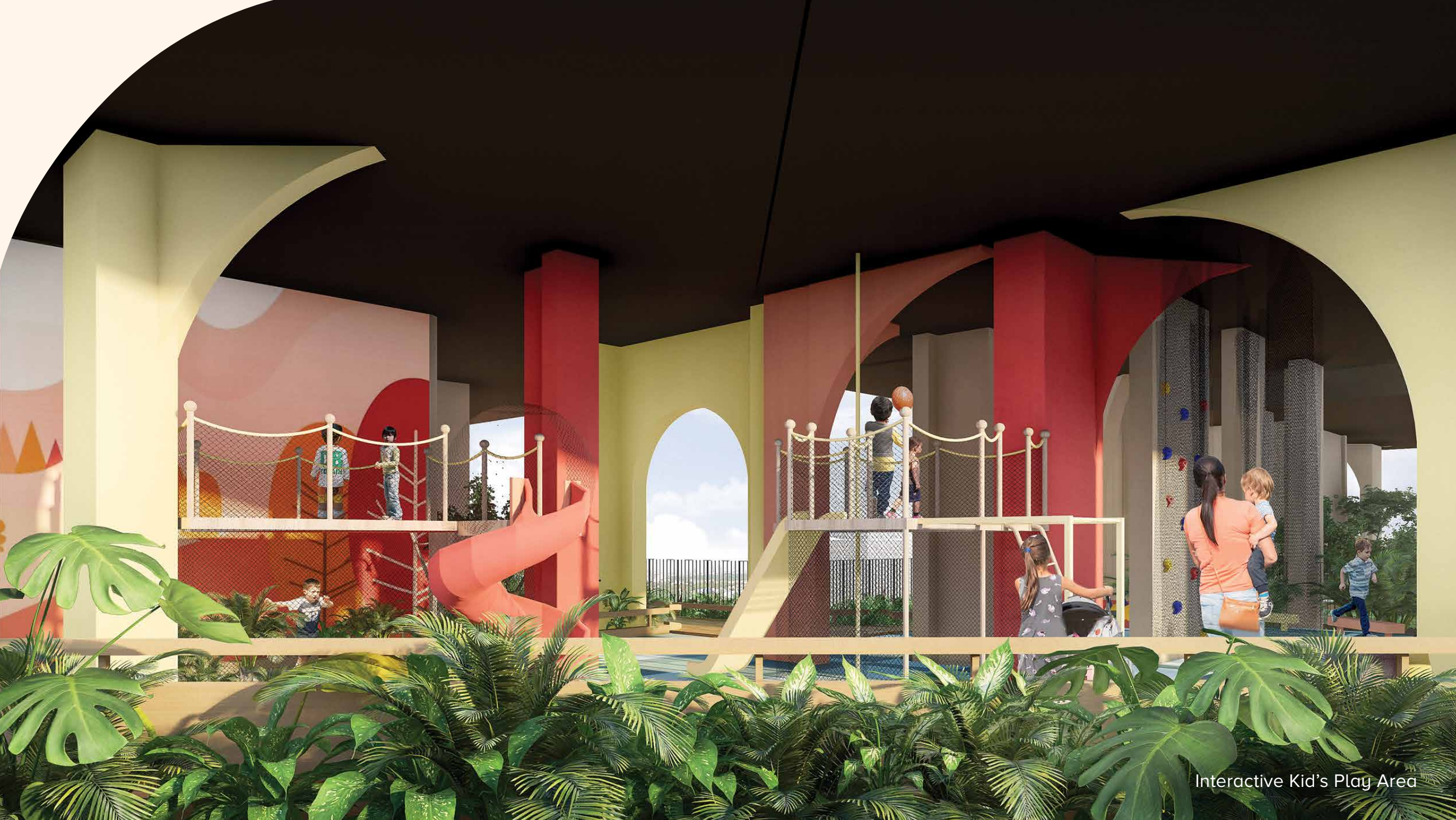
Interactive Kid's Play Area