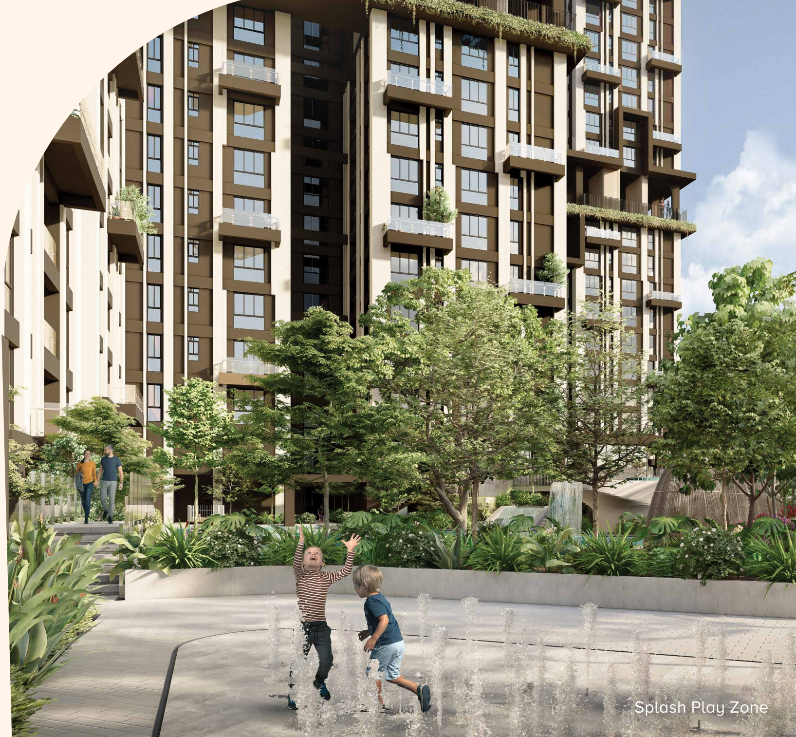
Splash Play Zone

There are amenities, and then there are amenities at Sanctuary. An endless list of sports, fitness, recreational and entertainment options for all ages. Honestly, there are so many things to choose from, we had to split them across 3 levels, the ground floor, the podium and the 16th floor level to accommodate them all.