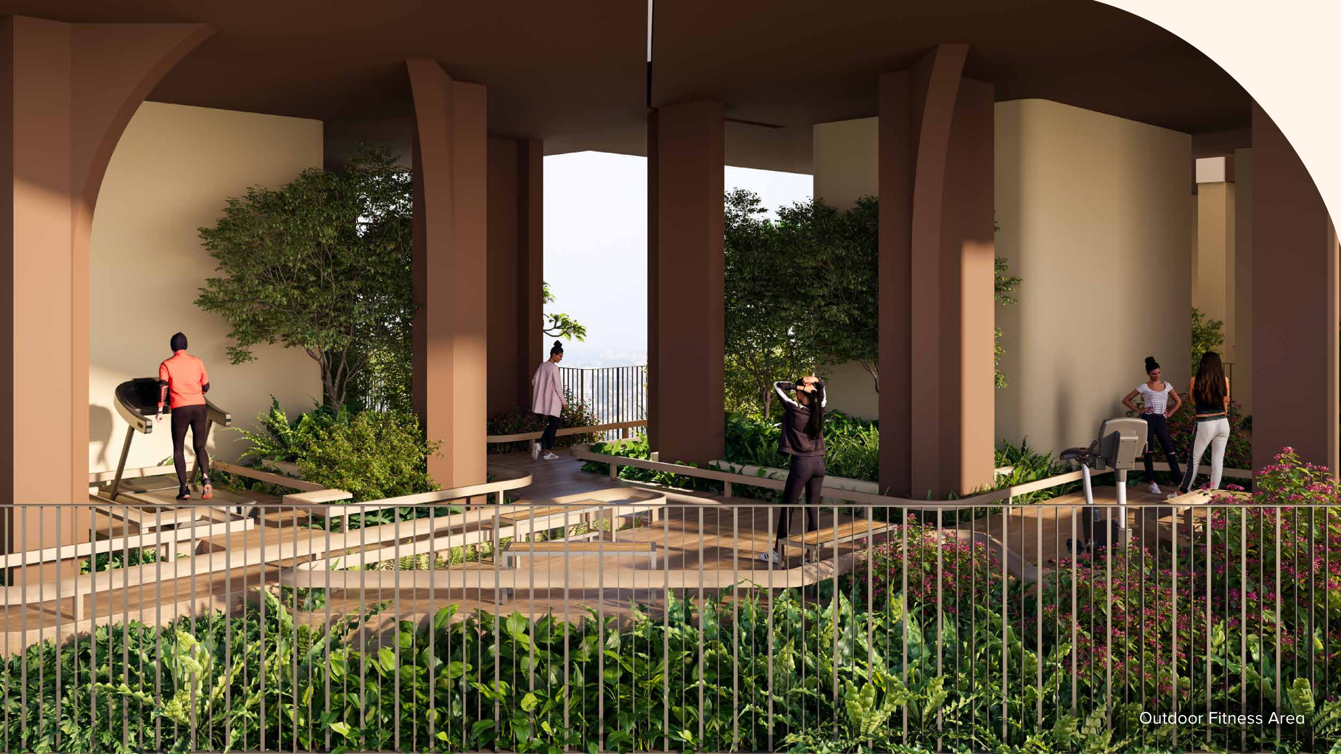
Outdoor Fitness Area