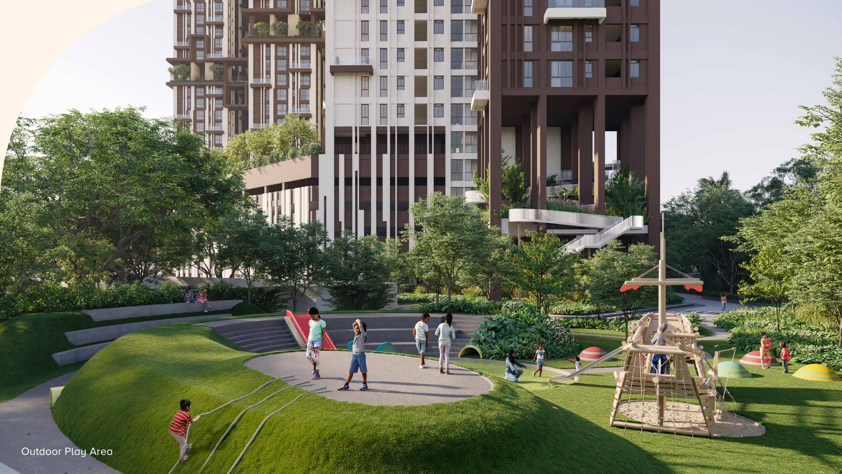
Outdoor Play Area