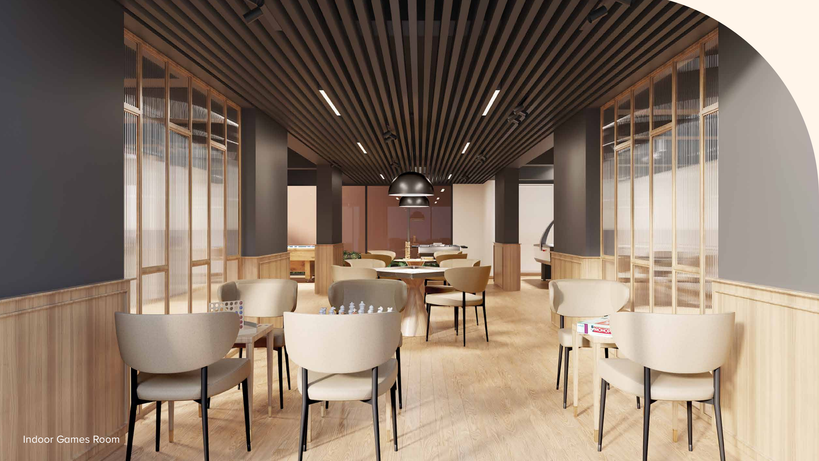
Indoor Games Room