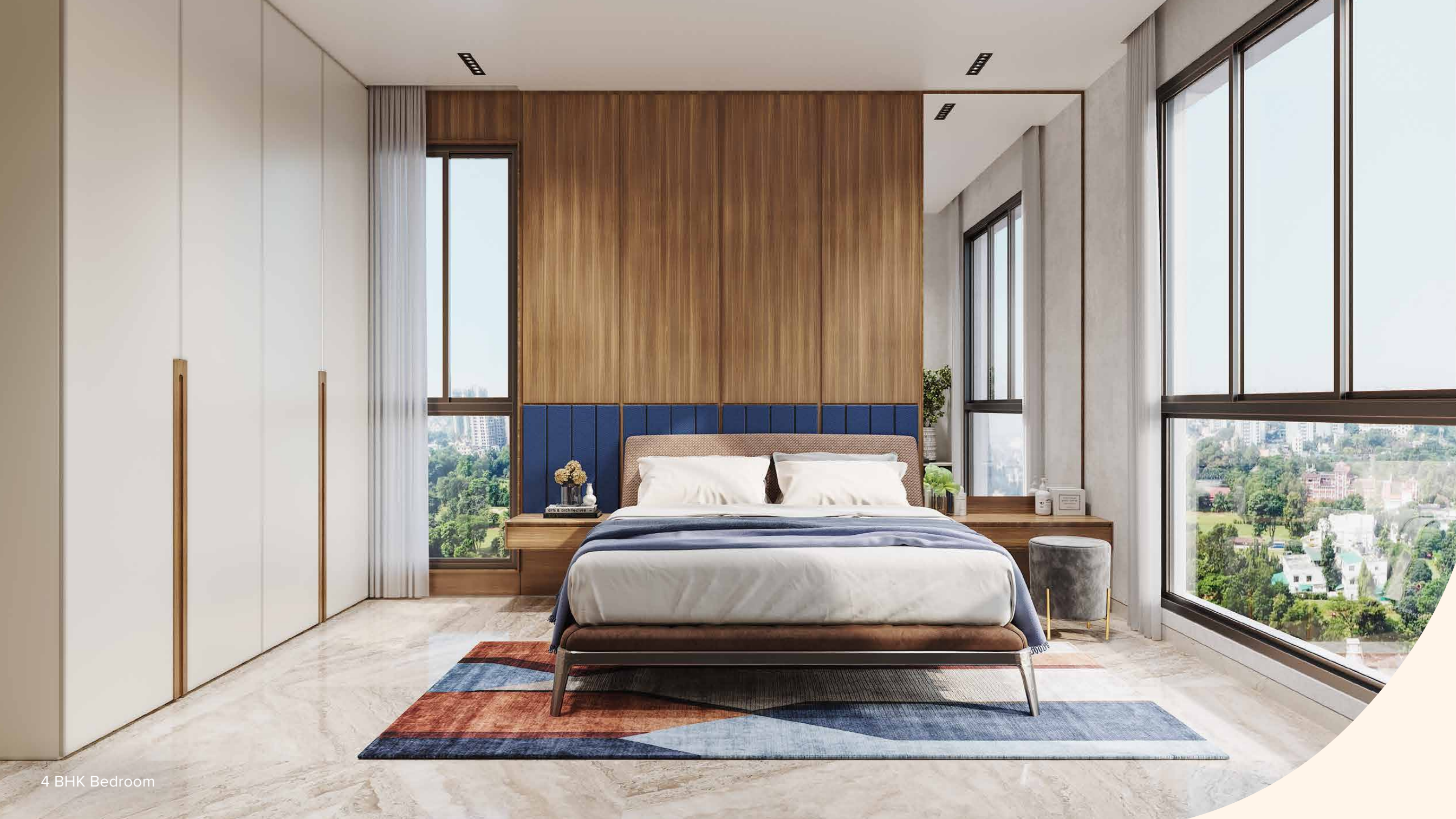
4 BHK Bedroom