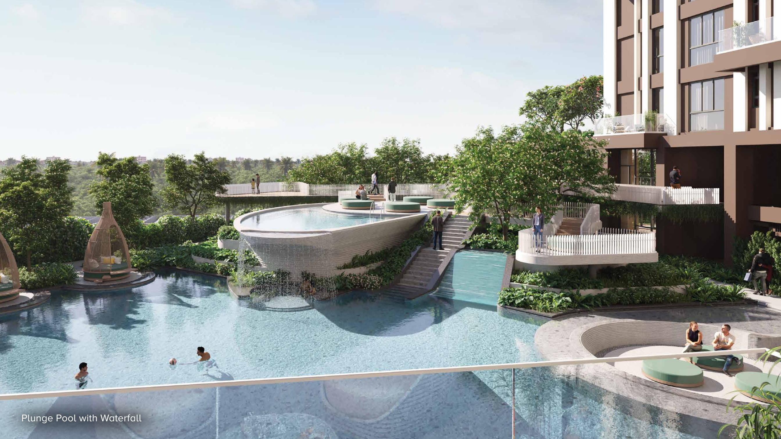
Plunge Pool with Waterfall