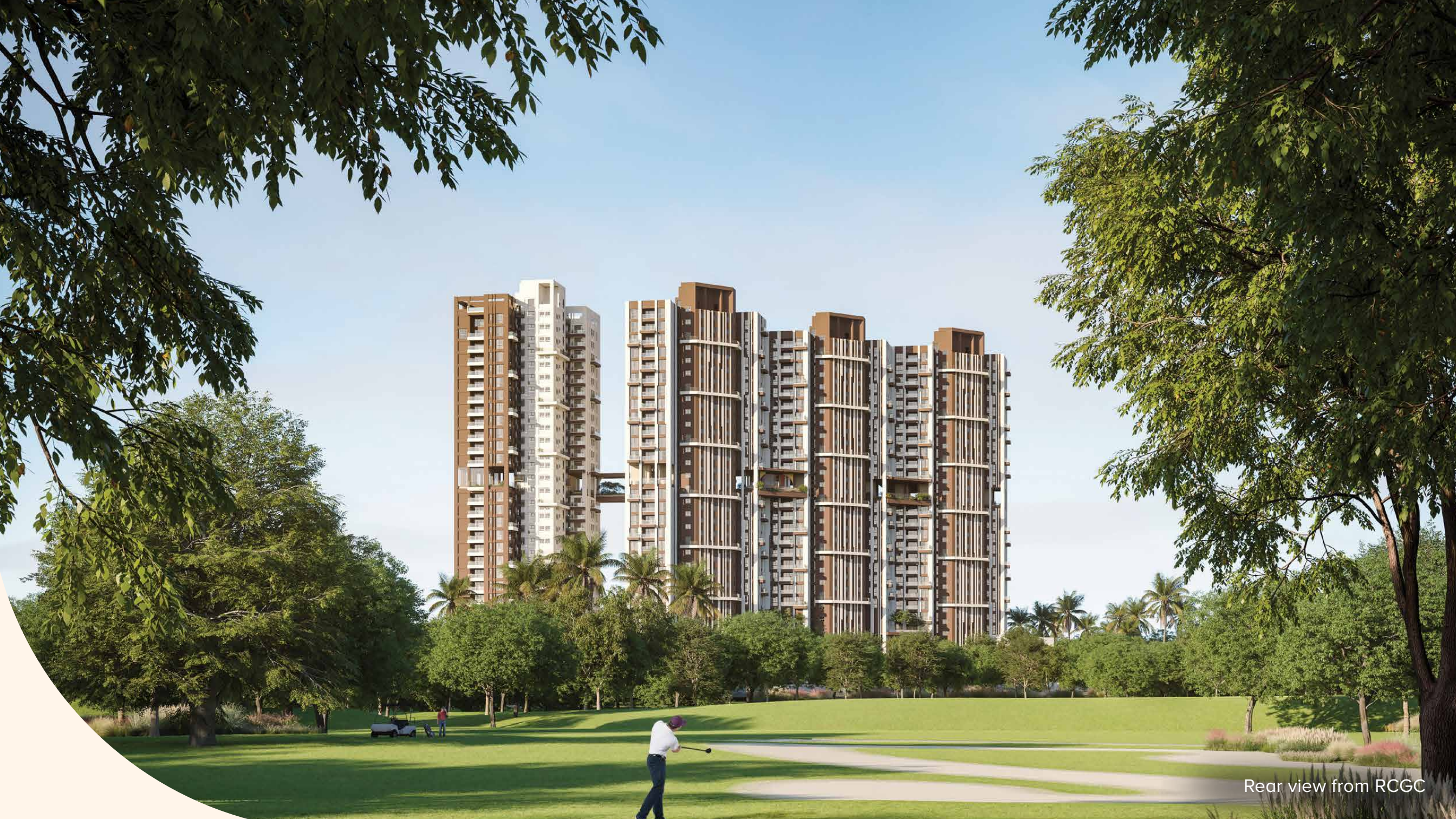
Rear view from RCGC