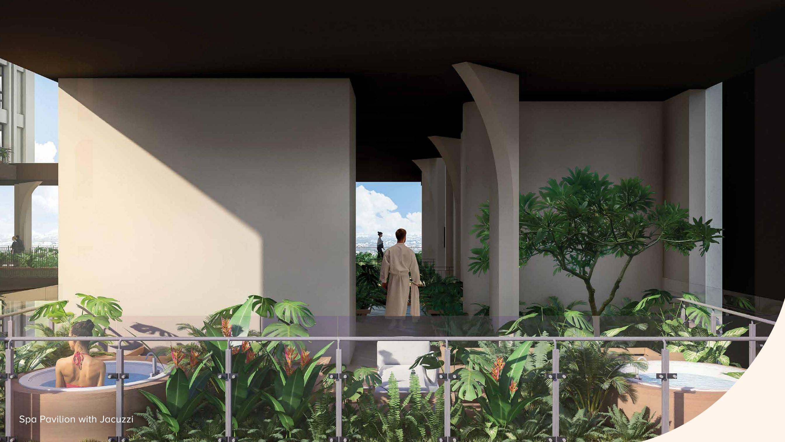
Spa Pavilion with Jacuzzi