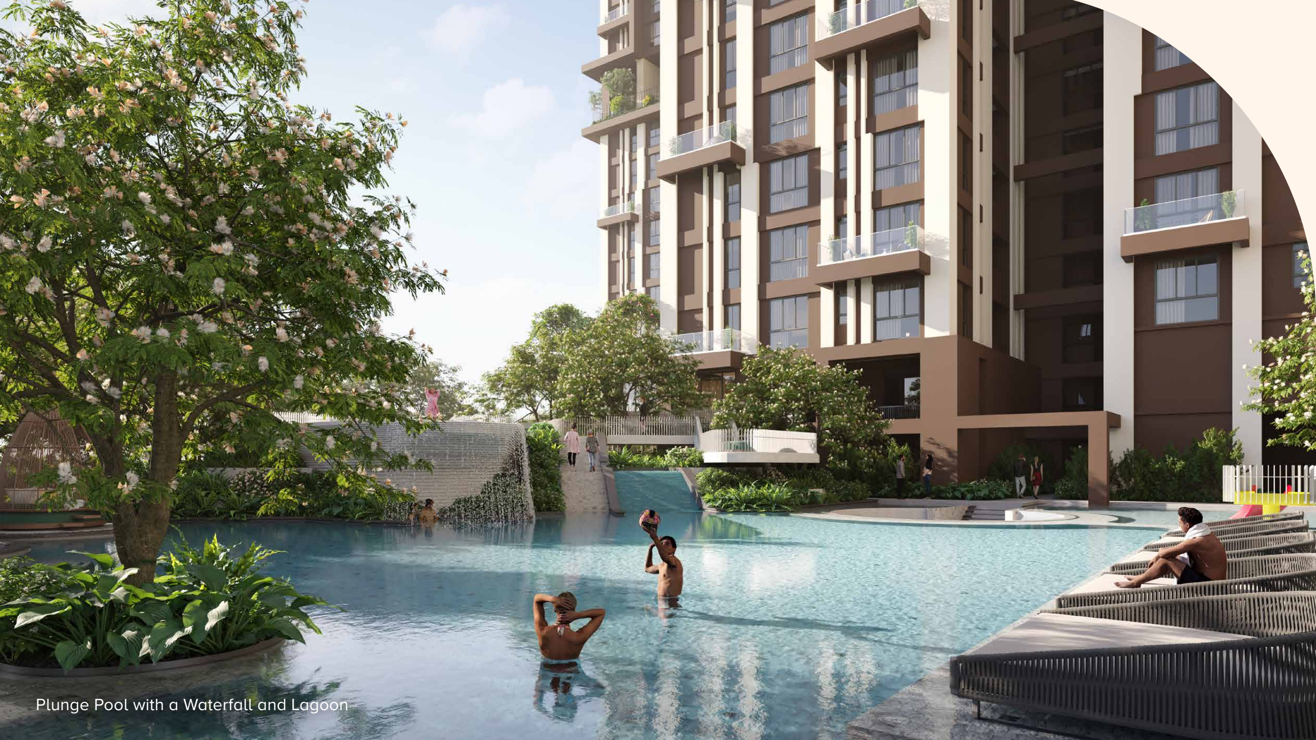
Plunge Pool with a Waterfall and Lagoon