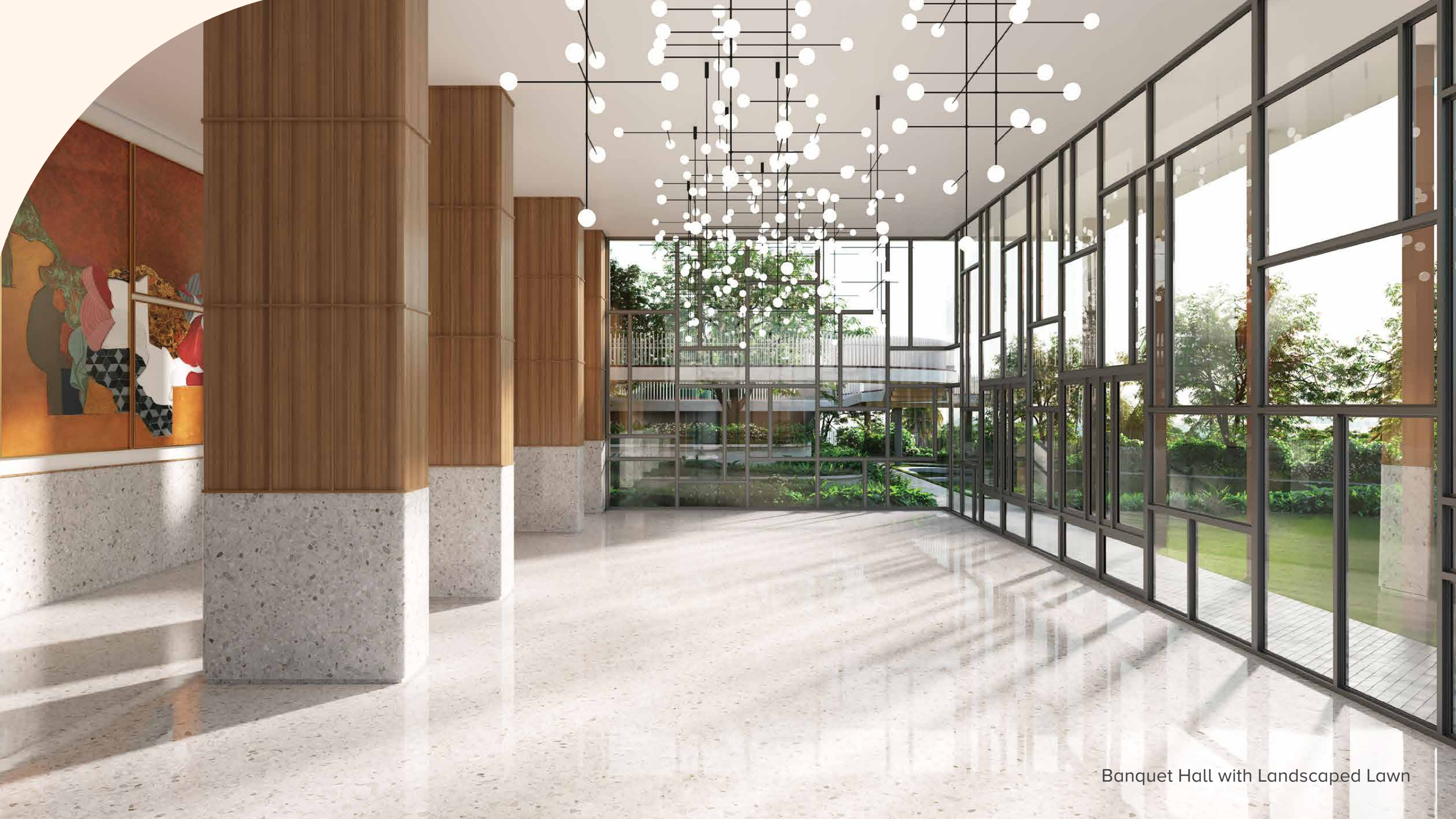
Banquet Hall with Landscaped Lawn