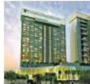
JW Marriott, Kolkata