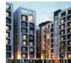
Signum Gardens, Kolkata