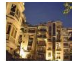
Heritage Hiyab, Kolkata