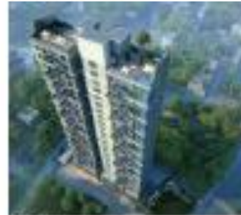
Victoria Wharf, Kolkata