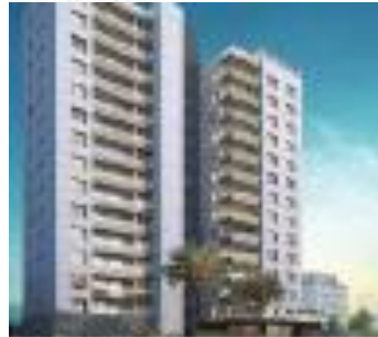
The Avenues, Kolkata