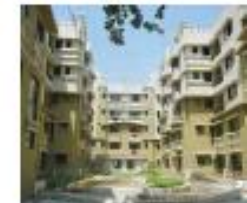
Silverwood Estate, Narmedapur