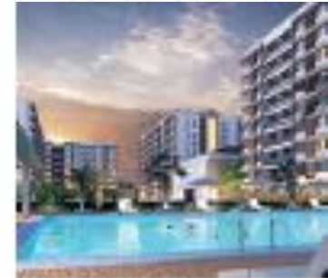
Silver Oak Estate, Kolkata