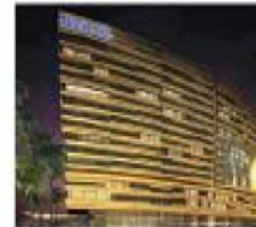
Novotel Hotel & Residences, Kolkata