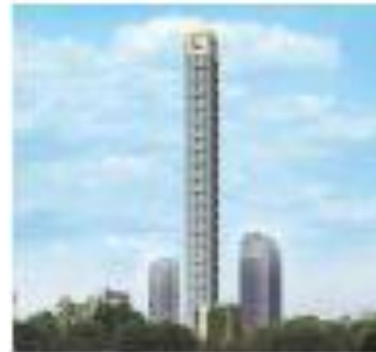
The 42, Kolkata