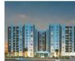
Cloud 9, Kolkata