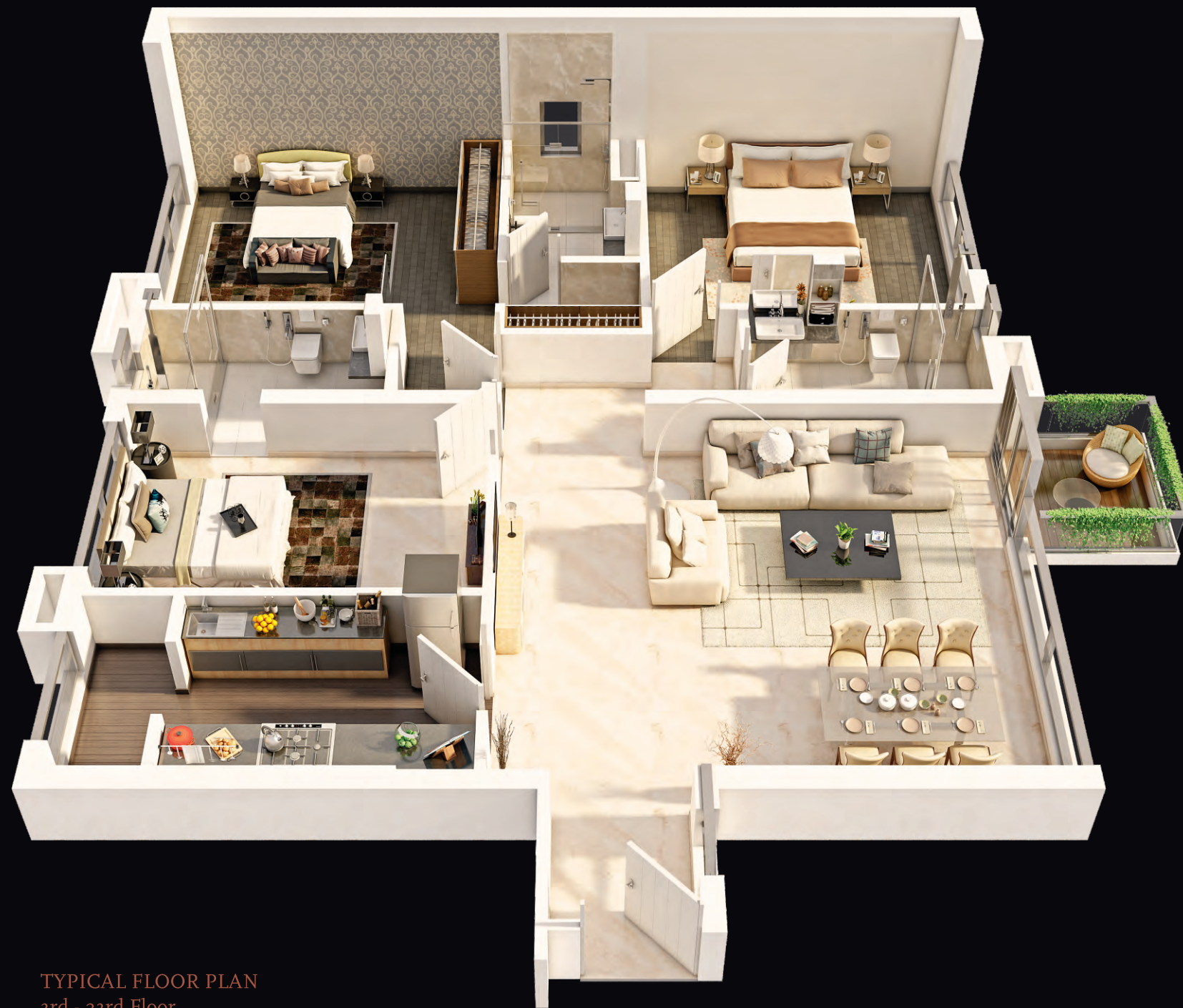
TYPICAL FLOOR PLAN 3rd - 23rd Floor