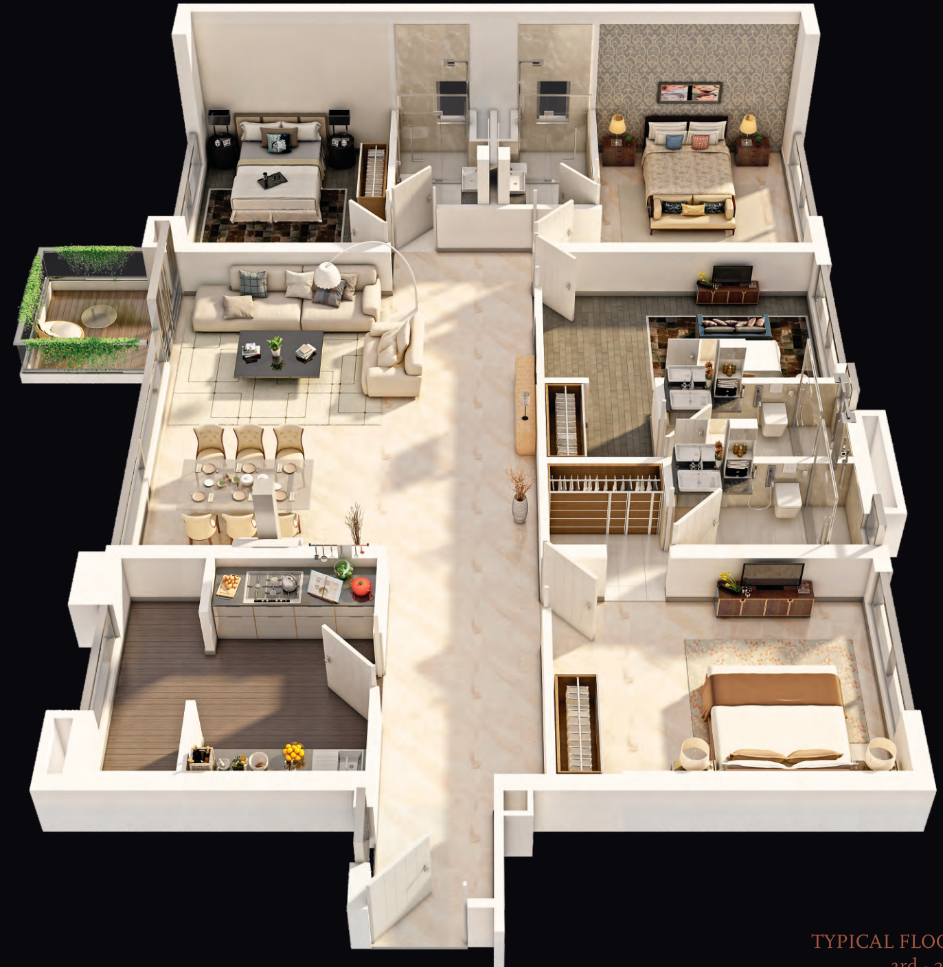
TYPICAL FLOOR PLAN 3rd - 23rd Floor